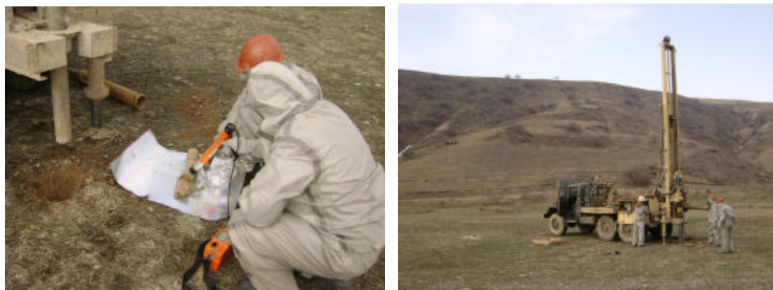
Figure 2: Kyrgyz geological staff commencing drilling and sampling tailings deposits